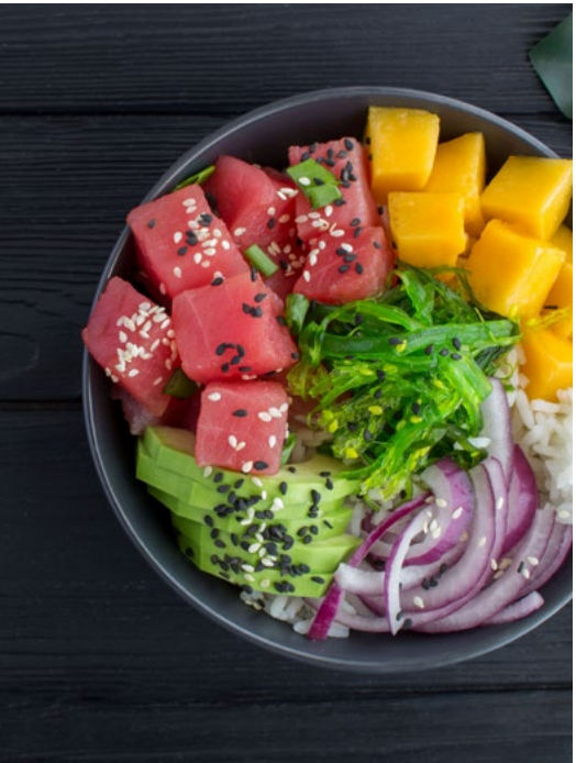
Food and Beverage